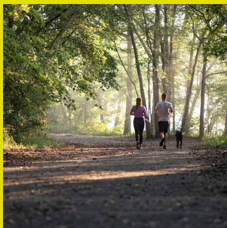
Bob Callan Trail at Paces Mill