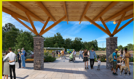
Visitor Information Center Rendering